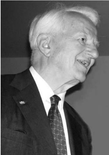
Bundespräsident a.D. Dr. Richard von Weizsäcker

Richard von Weizsäcker meets with the Young Königswinter Alumni of the Deutsch-Britische Gesellschaft and the Young Leaders Alumni of the Atlantik-Brücke